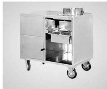
Trolleys & Others