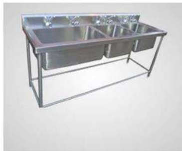
Dish Wash Area