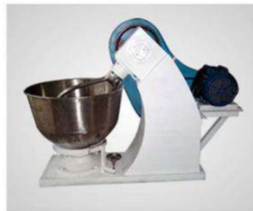
Preparation & Processing